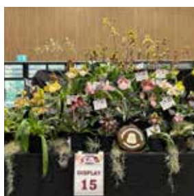
SOCIETY DISPLAY AT WOOLGOOLGA Read more on page 11