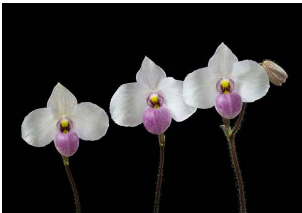
Paphiopedilum delenatii