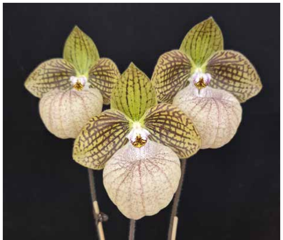
HYBRID OF THE EVENING Paph. Fanaticum FCC/AOC Grown By S. Tay