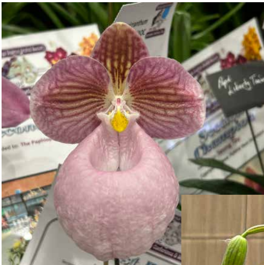
Paphiopedilum micranthum 'TOM #12'; Grown by: Seong Tay