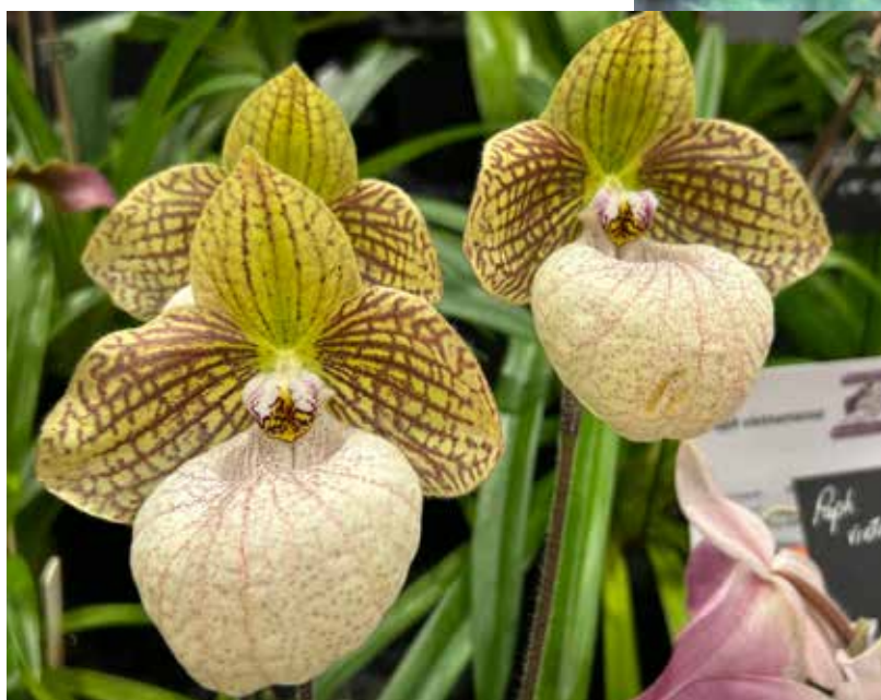
LEFT: Paphiopedilum Fanaticum 'TOM #1'; Grown by: Seong Tay