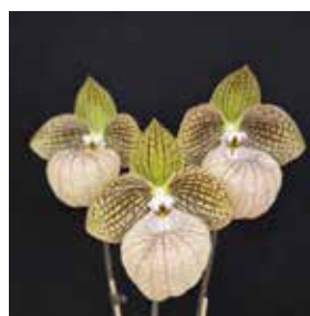
SEPTEMBER CHAMPION HYBRID Paph. Fanaticum FCC/AOC - S. Tay